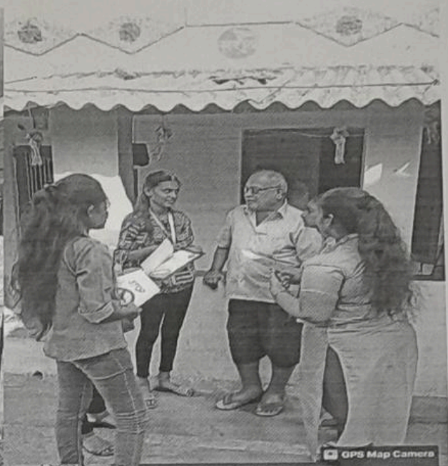
GPS Map Camera Navi Mumbai, Maharashtra, India Ganesh galli, Elethanpada, Ram Nagar, Subhash Nagar, Digha, Navi Mumbai, Maharashtra 400708, India Lat 19.172325° Long 73.006527° 30/12/22 11:09 AM GMT +05:30