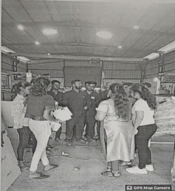
GPS Map Camera Navi Mumbai, Maharashtra, India 52C4+G58, Digha Naka, Ram Nagar, Subhash Nagar, Digha, Navi Mumbai, Maharashtra 400708, India Lat 19.17132° Long 73.006416° 30/12/22 11:22 AM GMT +05:30