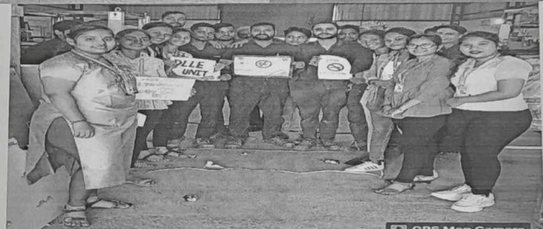
GPS Map Camera Navi Mumbai, Maharashtra, India 52C4+G58, Digha Naka, Ram Nagar, Subhash Nagar, Digha, Navi Mumbai, Maharashtra 400708, India Lat 19.171324° Long 73.005466° 30/12/22 11:21 AM GMT +05:30